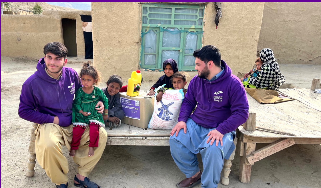
HRM Afghanistan Deployment 2023

Despite the immense challenges of 2023, Human Relief Missions efforts brought life-saving support to countless Afghan communities. As we move forward, we remain committed to aiding Afghanistan's recovery, working alongside those in need to help rebuild their futures.